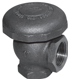
710 1" - 2" (25-50mm)