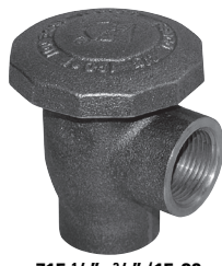
715 1/2" - 3/4" (15-20mm)