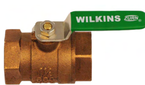
Size 3/8" - 2"