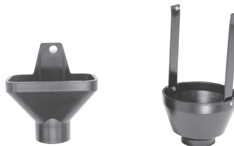
¾" - 2"

The air gap drain shall be FEBCO Series AGD or prior approved equal.